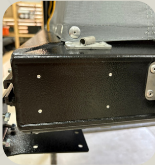
Marking of Holes

3. Drill 4 holes: From the back of the tent, where the latches are located, mark out the four (4) using the bracket as a template (See picture below). Drill using the 8mm drill bit where you marked out.