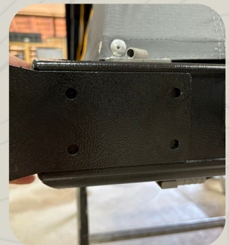
2. Back of Tent