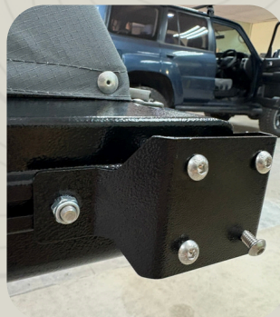
1. Side of Tent

2. Use the Corner bracket that bolts onto the back of the tent (Refer to photo 1), and slide the cup square bolt into the side rail of the tent. Place the bracket in place and loosely tighten. (Refer to photo 2)